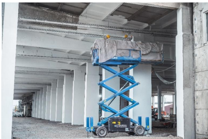
(2) First, 500 m 2 of truss area were prepared with high-pressure water jets and then covered with a surface protection coating.