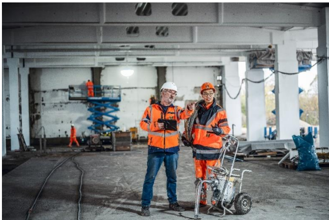
(1) In total, more than 90 supporting pillars were extensively rehabilitated.