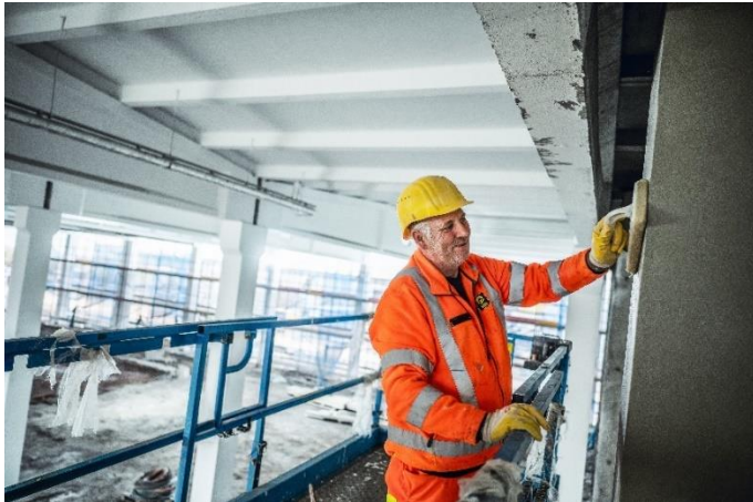
(3) To finish the surfaces, the applied coating was rubbed in by hand.