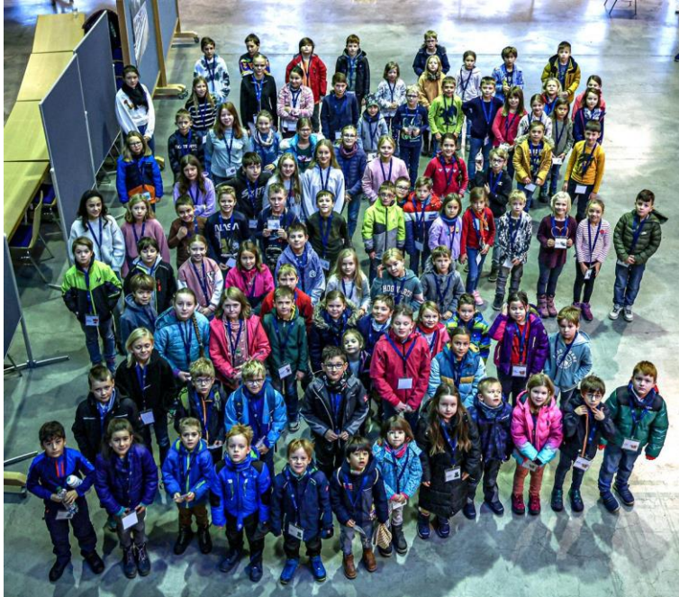
(1) 100 children attended the Bauer employees' children's day.