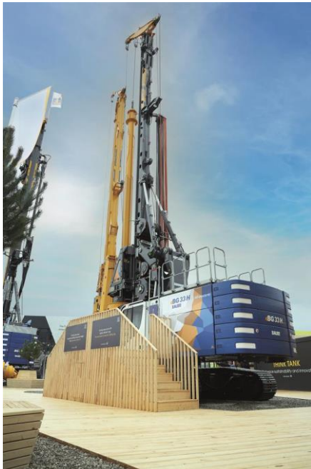
(2) One of the highlights this year: the BAUER eBG 33 H all electric.