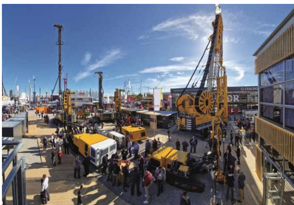
(4) The exhibits from KLEMM Bohrtechnik GmbH (at the front of the picture), including the electrohydraulic KR 806-3E, were also very well received.