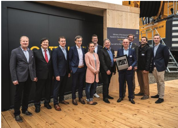
(5) The partners of the Deep Sea Sampling project were delighted to receive the Bauma Innovation Award in the Research category.